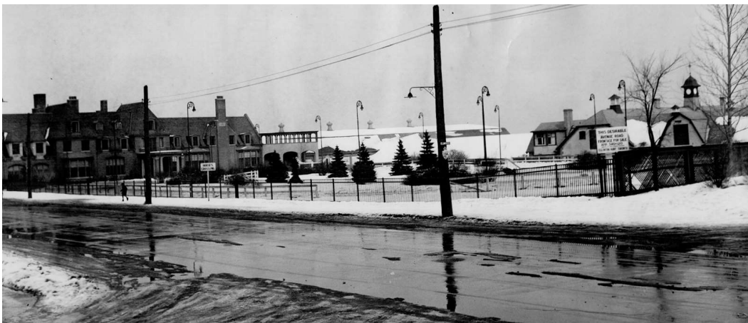
No. 1 I.T.S.

There is very little information or photos on the Internet about No. 1 Eglinton Hunt Club, Toronto, Ontario.